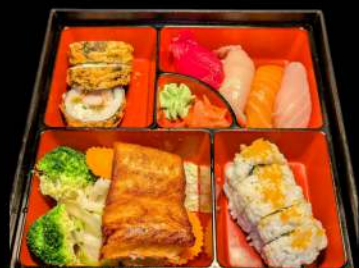
TERIYAKI &amp; NIGIRI COMBO