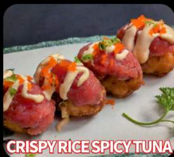
CRISPY RICE SPICY TUNA