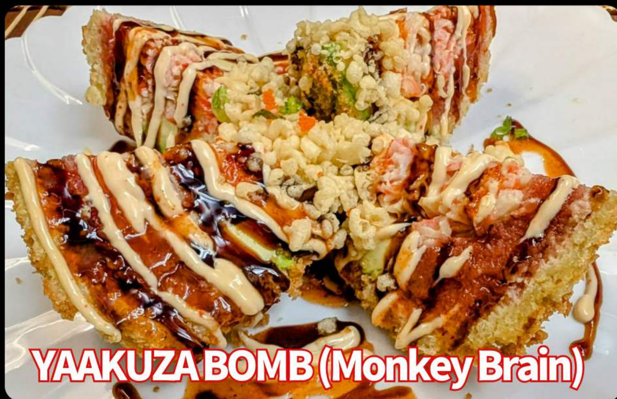
YAAKUZA BOMB (Monkey Brain)

* Consuming raw or undercooked meats, poultry, seafood, shellfish or eggs may increase the risk of food illness