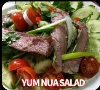
YUM NUA SALAD