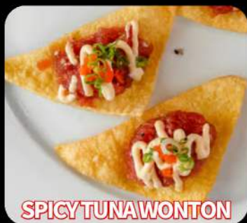
SPICY TUNA WONTON