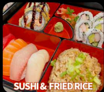
SUSHI &amp; FRIED RICE