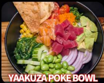
YAAKUZA POKE BOWL