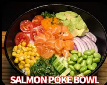
SALMON POKE BOWL