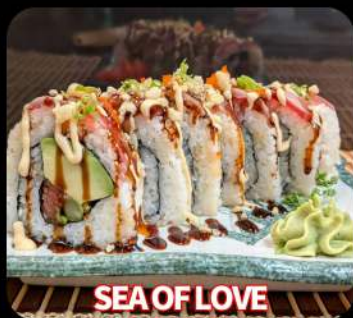
SEA OF LOVE