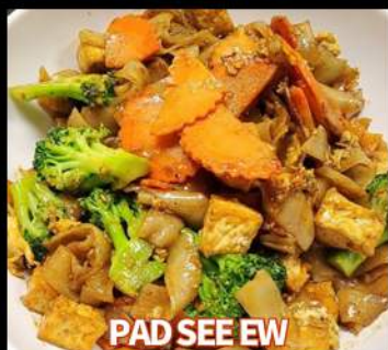
PAD SEE EW